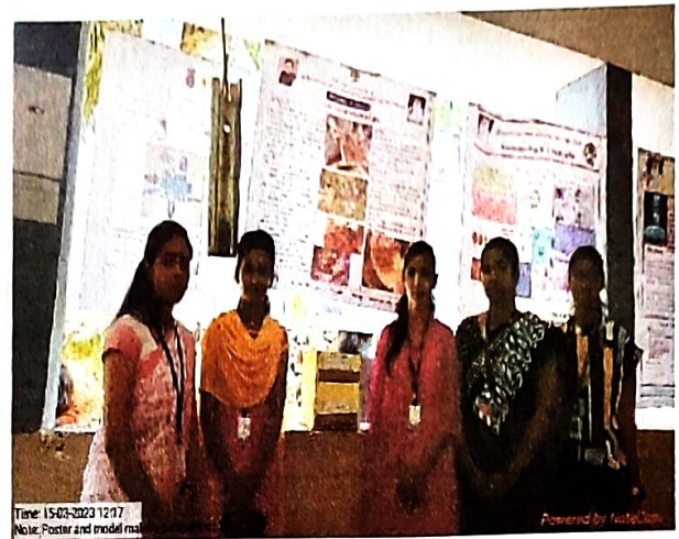
B.Sc. I and B.Sc. II. Students participation in poster exhibition